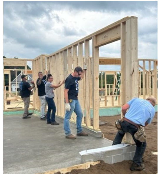
We have the best volunteers! Here are volunteers from Wabash and the community working alongside our homeowner partner.

Thank you to all the teams, sponsors, and volunteers who made it such a great day. Join us next year on Monday, June 9, 2025!